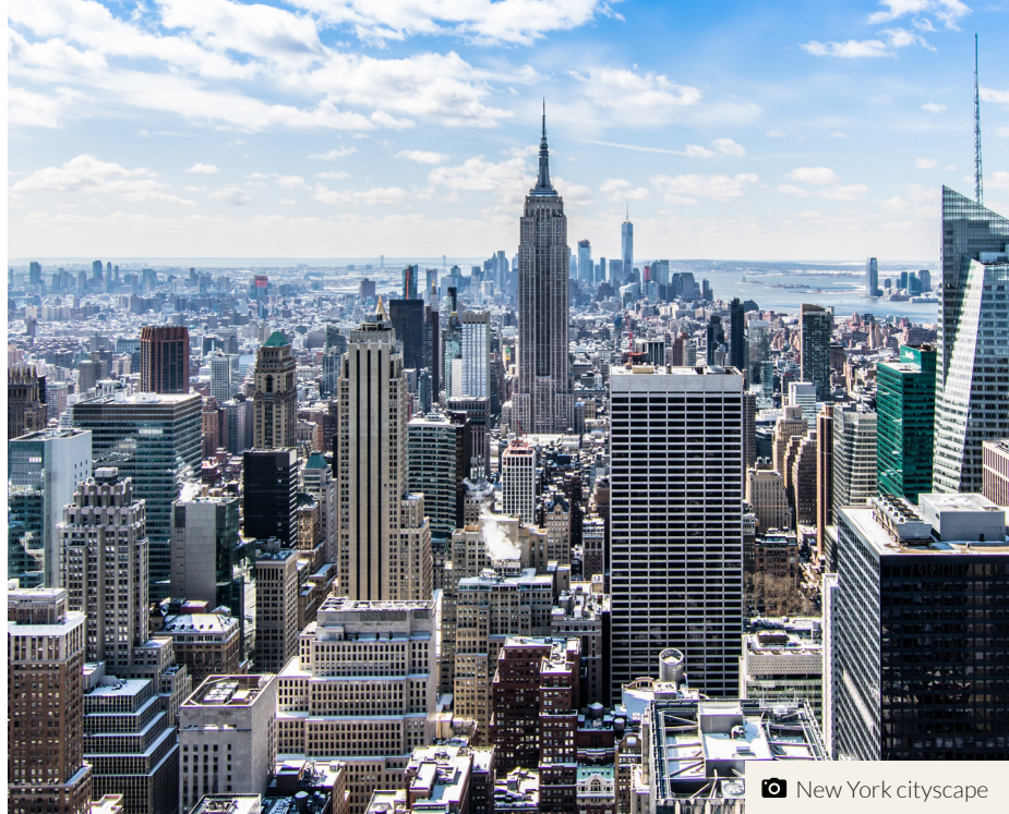
📷 New York cityscape

**Additional Airport Transfer Fees required for groups and individuals from these airports.