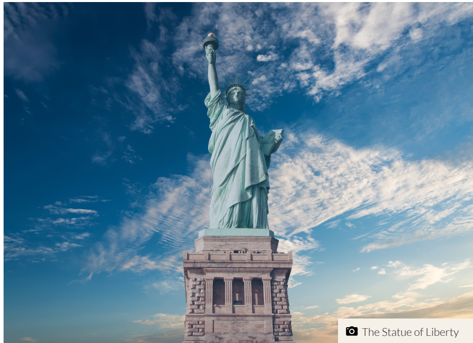
📷 The Statue of Liberty