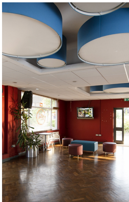
📷 Social facilities