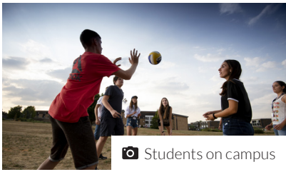
Students on campus