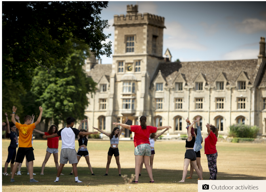
📷 Outdoor activities