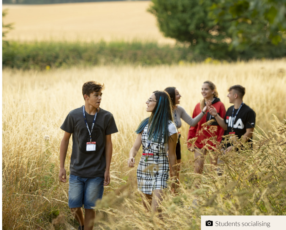
📷 Students socialising

** (Supplements and minimum numbers may apply)