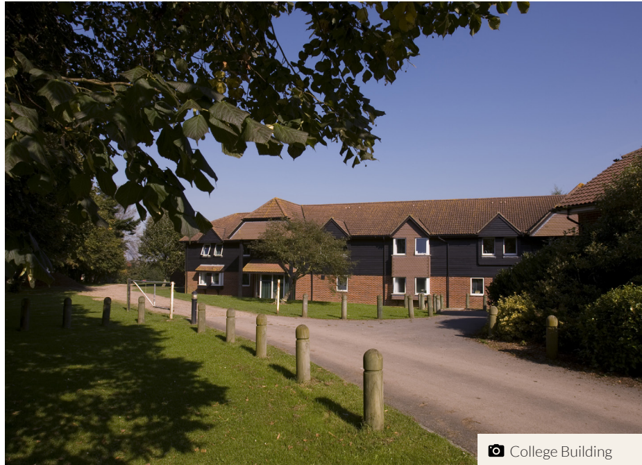
📷 College Building