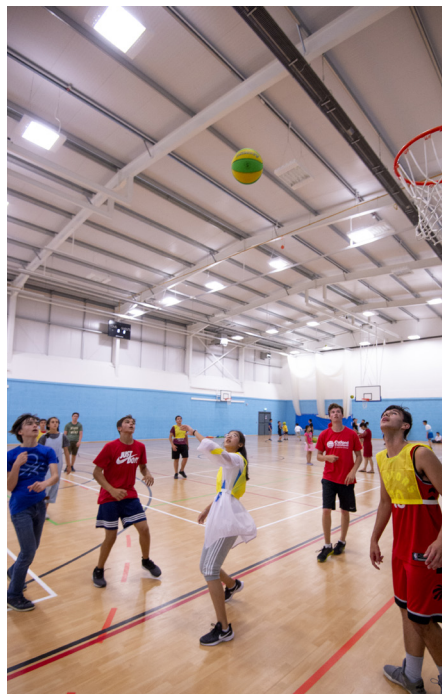
📷 Sports facilities