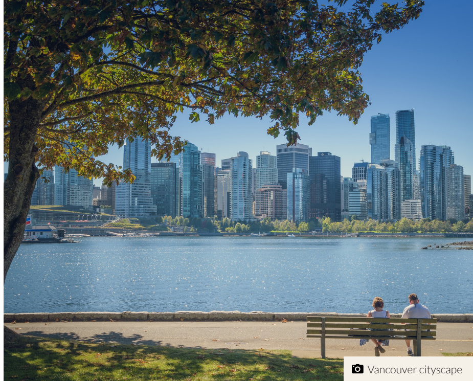
📷 Vancouver cityscape

*For individuals, airport transfers incur additional charges.