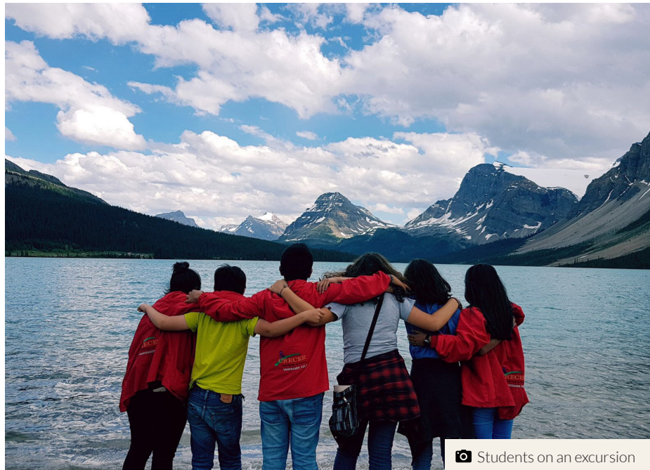
📷 Students on an excursion