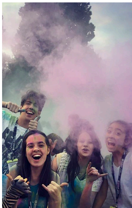
📷 Students at the Colour Run