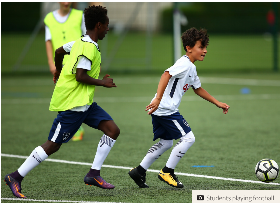
Students playing football