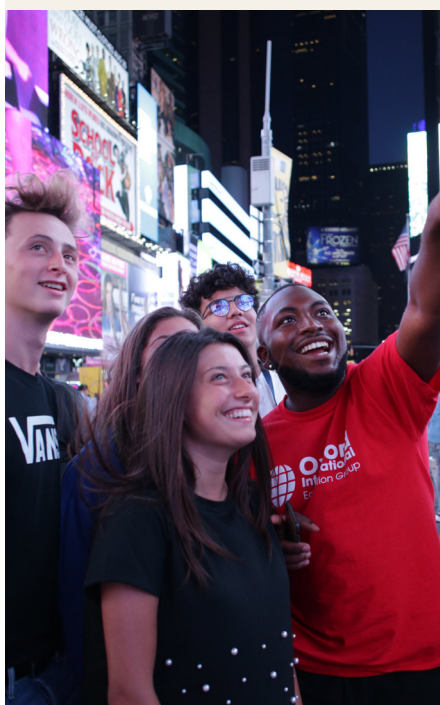
📷 Exploring New York