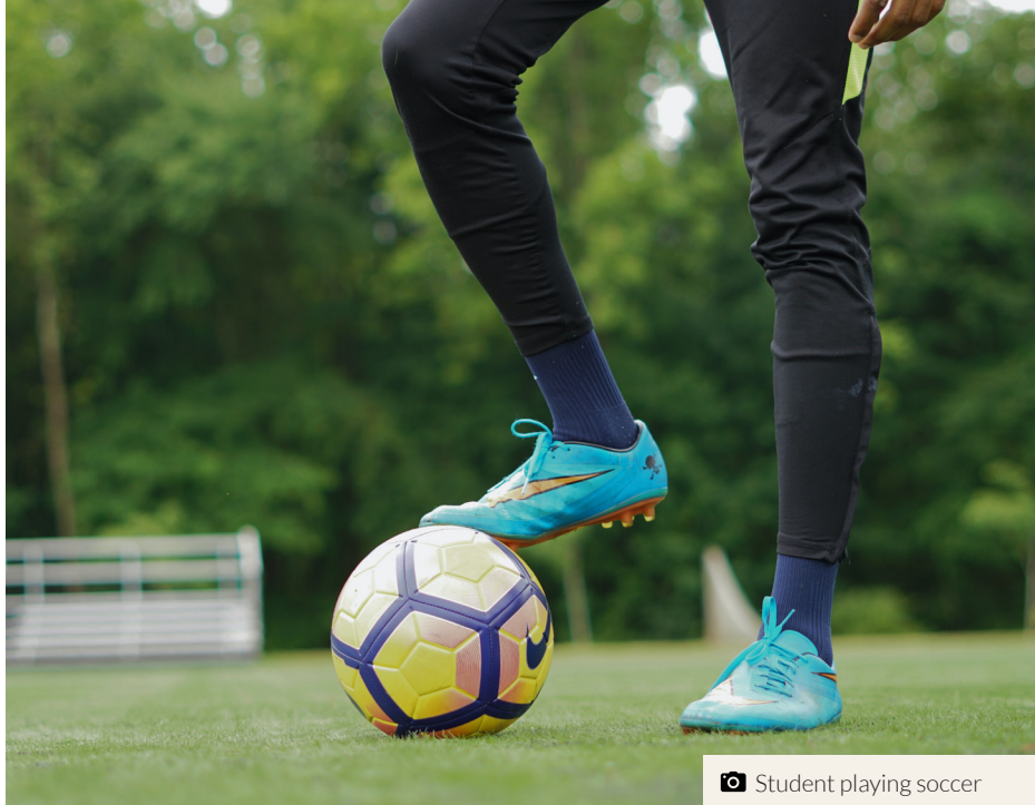
📷 Student playing soccer

**Additional Airport Transfer Fees required for groups and individuals from these airports.