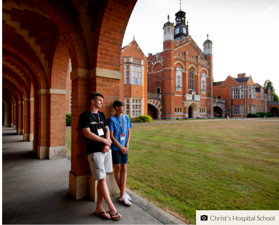
Christ's Hospital School

** (Supplements and minimum numbers may apply)