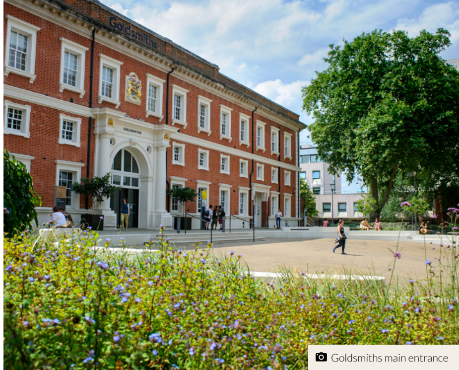
📍 Goldsmiths main entrance

1 All students must be born before 1/1/2011