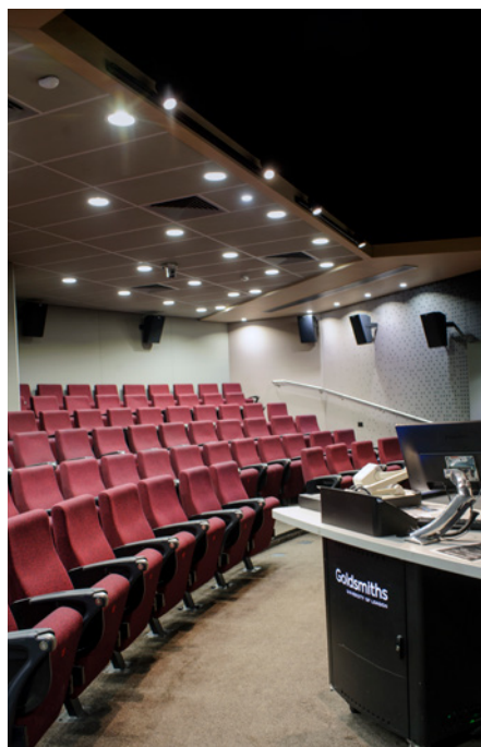
📍 Teaching facilities