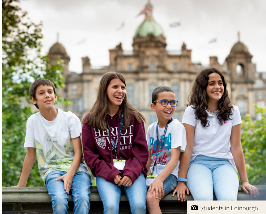
📷 Students in Edinburgh

** (Supplements and minimum numbers may apply)