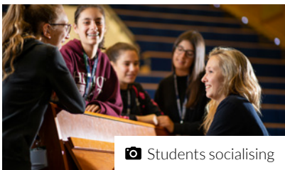
📷 Students socialising