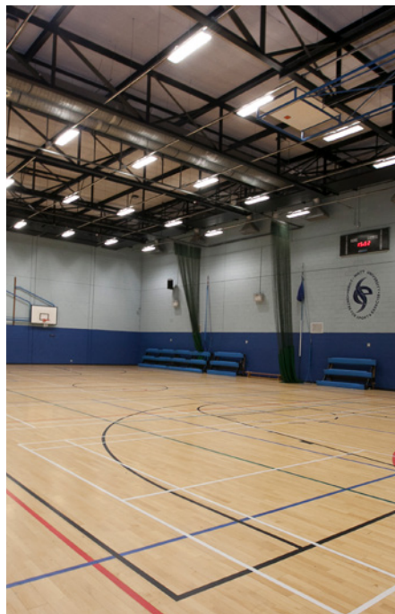
📷 Sports facilities