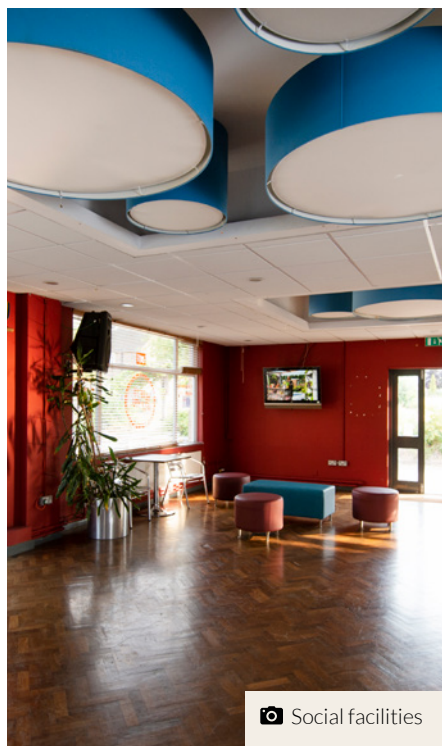
📷 Social facilities