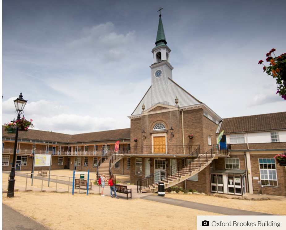
📷 Oxford Brookes Building

*All students must be born before 1/1/2011