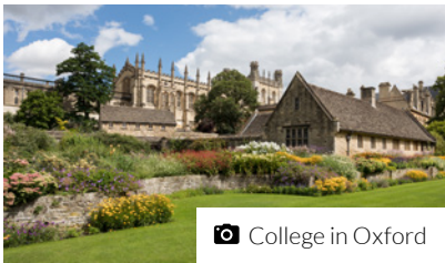
📷 College in Oxford