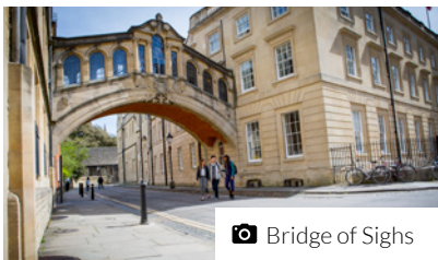
📷 Bridge of Sighs