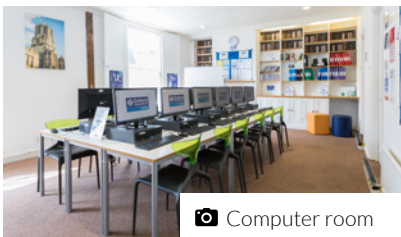
📷 Computer room