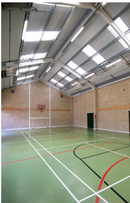
📷 Sports facilities