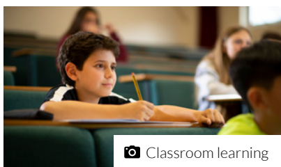
📷 Classroom learning