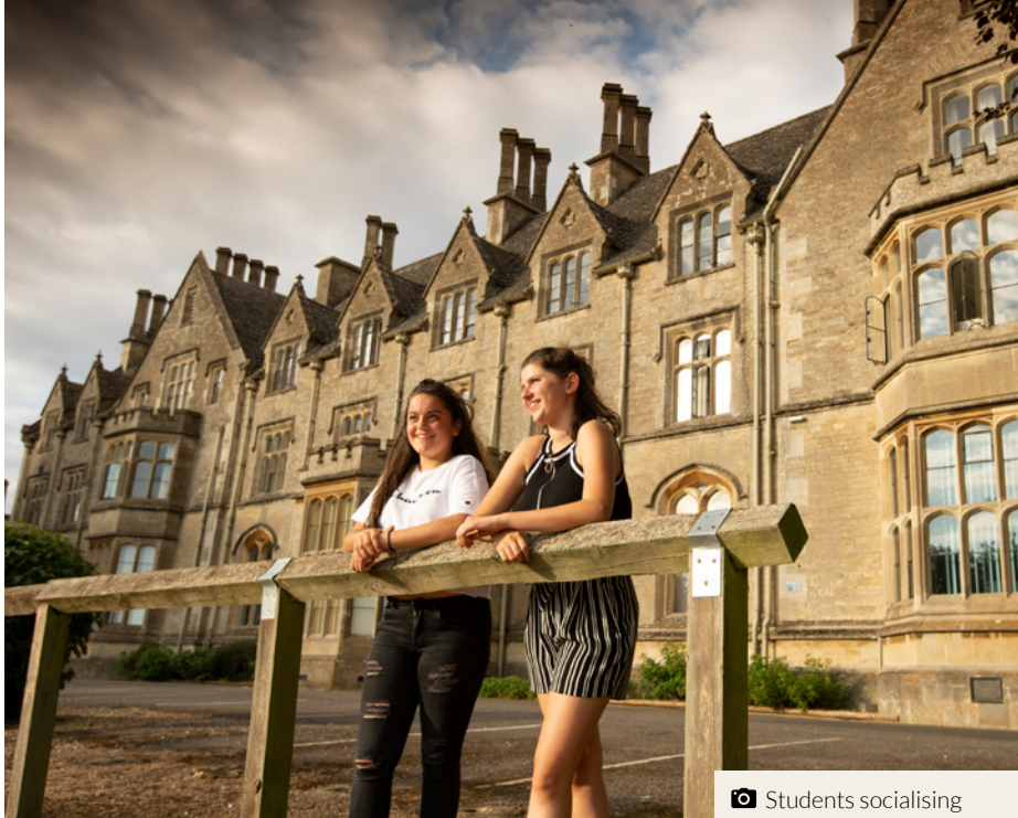
📷 Students socialising

** (Supplements and minimum numbers may apply)