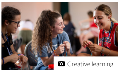
📷 Creative learning