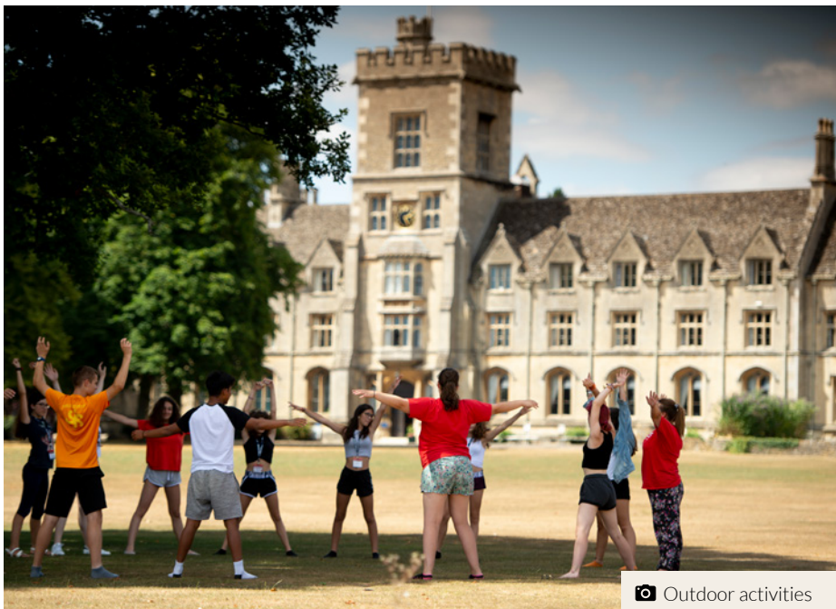
📷 Outdoor activities