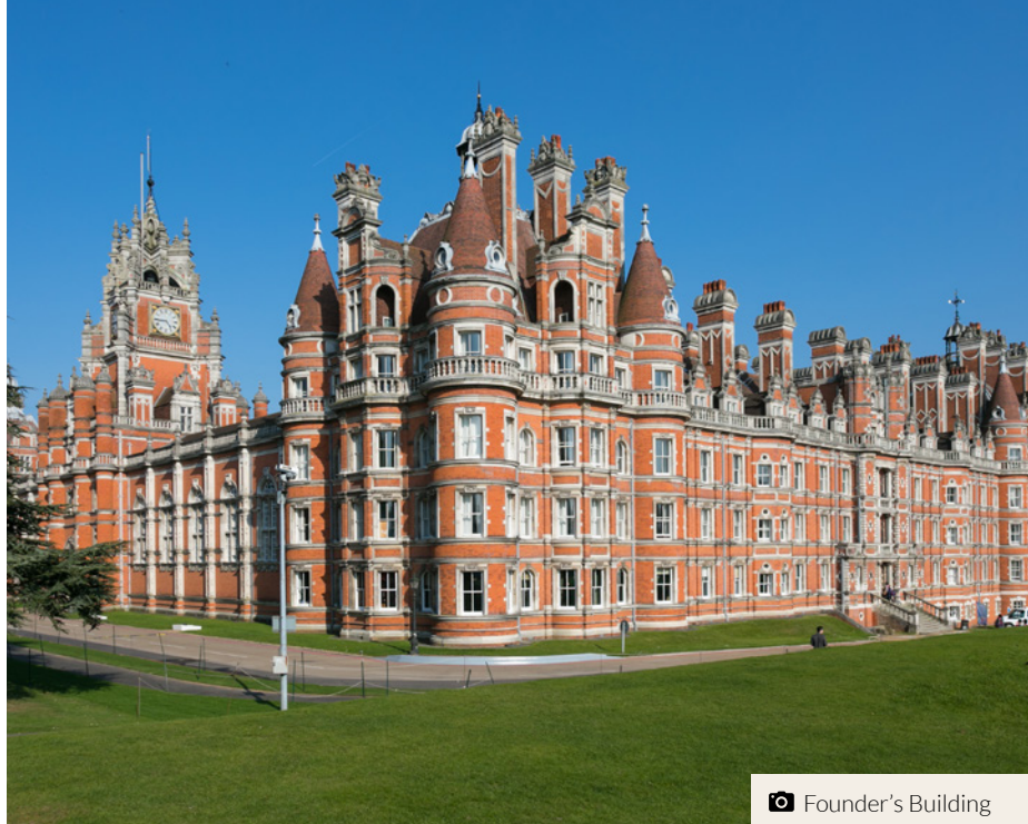
📷 Founder's Building