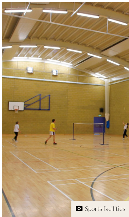
📷 Sports facilities