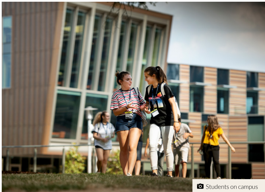
📷 Students on campus