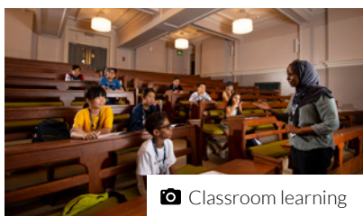
📷 Classroom learning