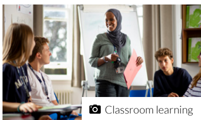
📷 Classroom learning