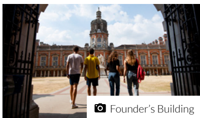
📷 Founder's Building