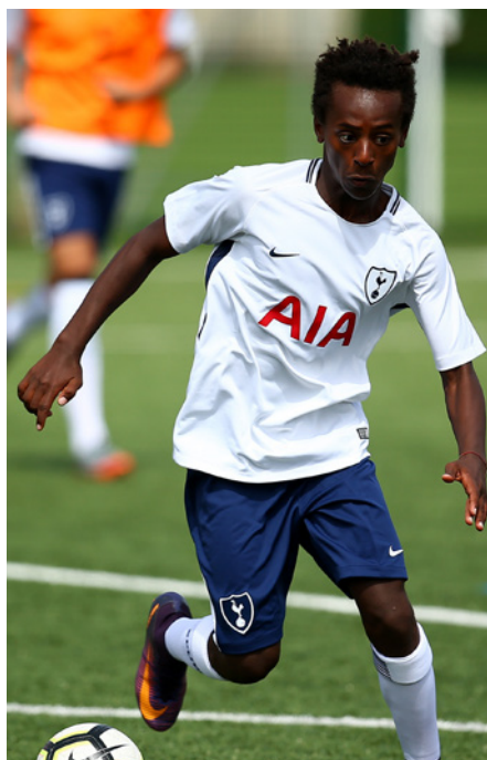
📷 Student playing football