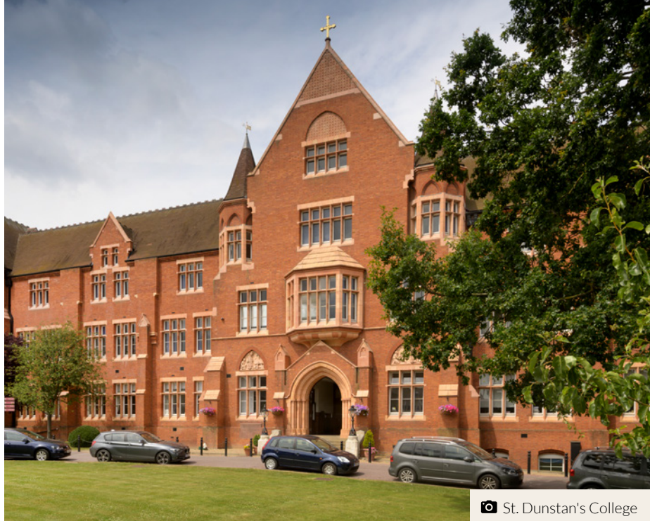
📷 St. Dunstan's College

** (Supplements and minimum numbers may apply)