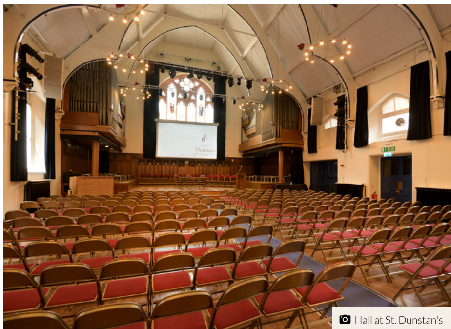
📷 Hall at St. Dunstan's