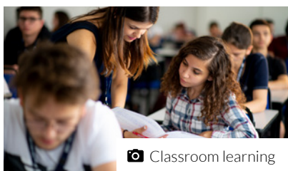
📷 Classroom learning