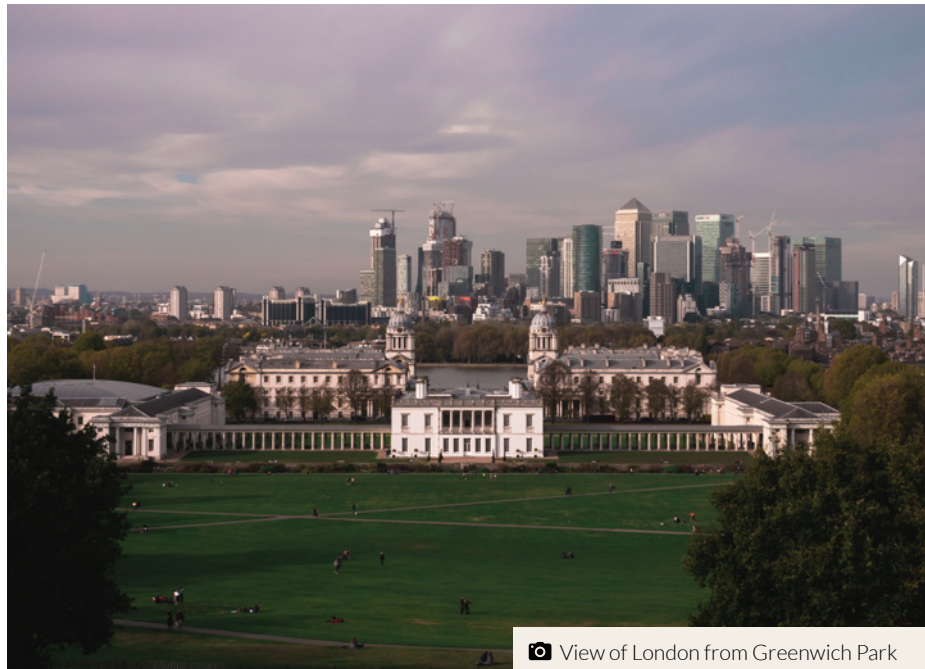
📷 View of London from Greenwich Park