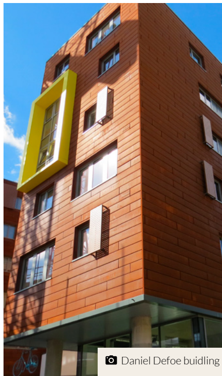
📷 Daniel Defoe building