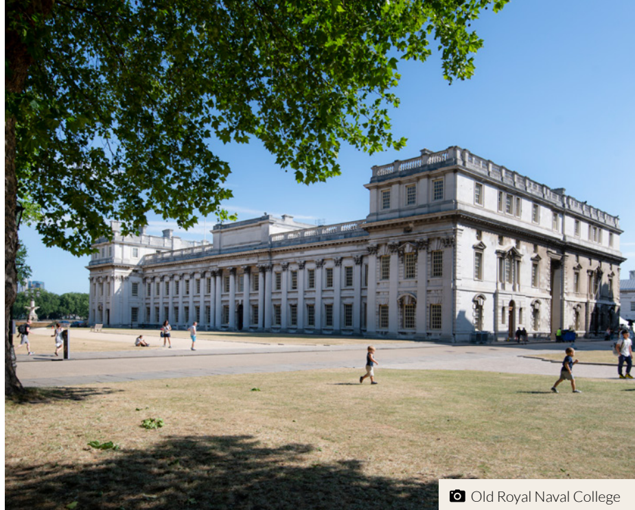
📷 Old Royal Naval College

** (Supplements and minimum numbers may apply)