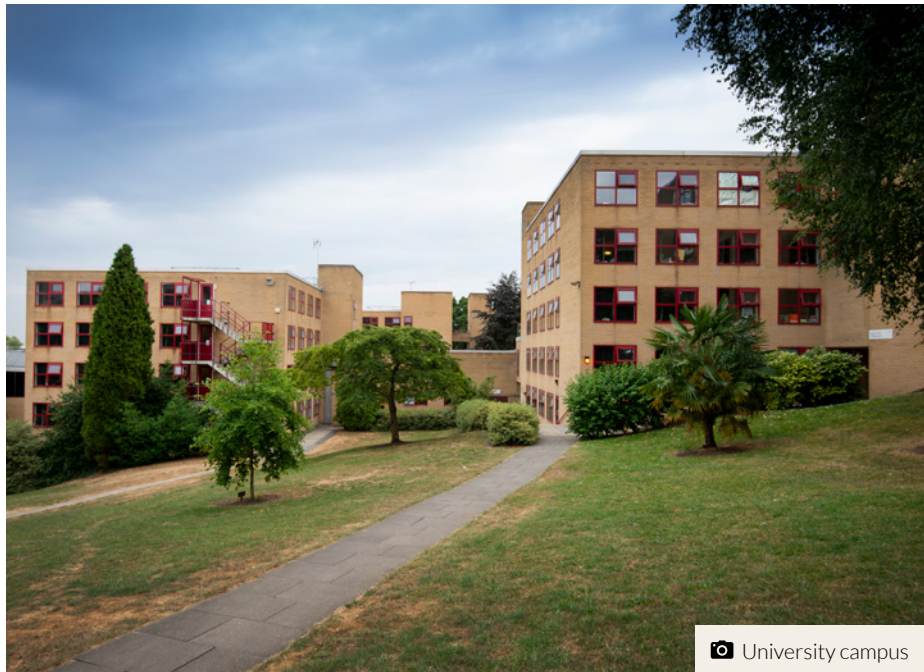
📷 University campus