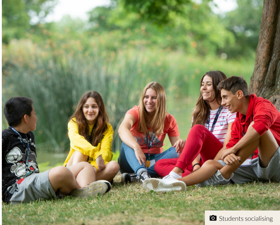
📷 Students socialising

** (Supplements and minimum numbers may apply)