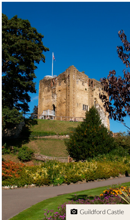
📷 Guildford Castle