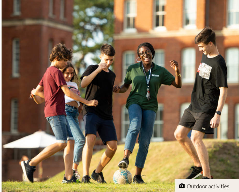
📷 Outdoor activities

** (Supplements and minimum numbers may apply)