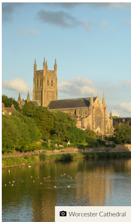
📷 Worcester Cathedral