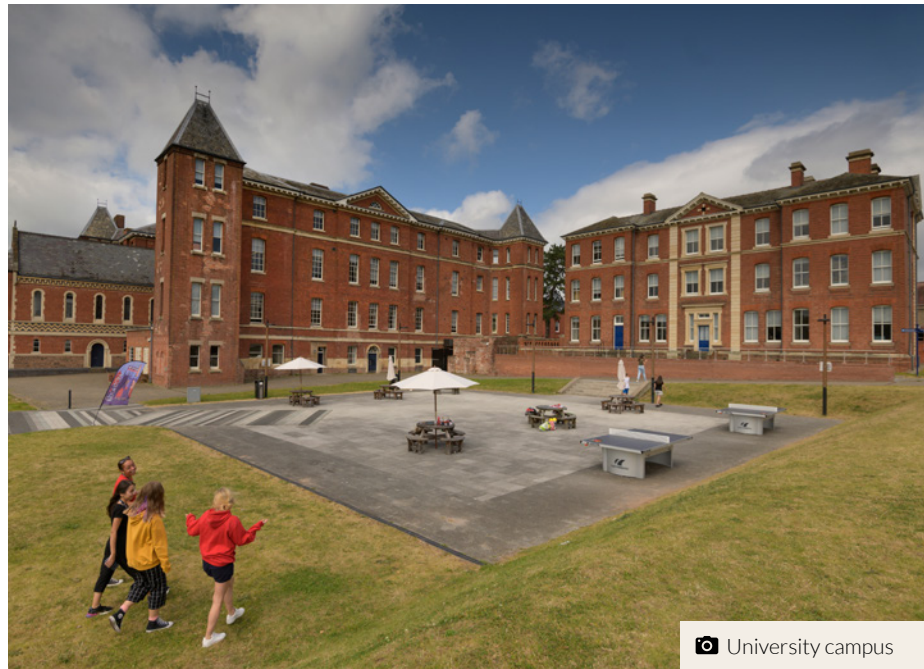
📷 University campus