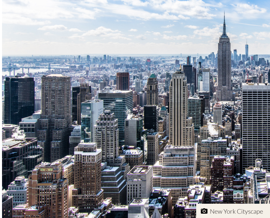
New York Cityscape

**Additional Airport Transfer Fees required for groups and individuals from these airports.