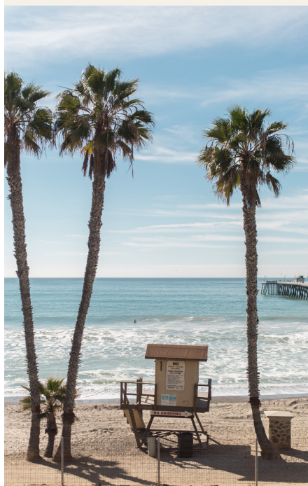
A Beach in San Diego