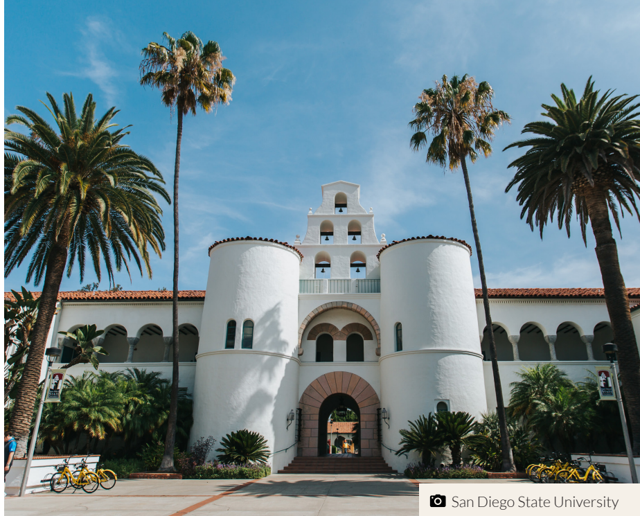
San Diego State University

**Additional Airport Transfer Fees required for groups and individuals from these airports