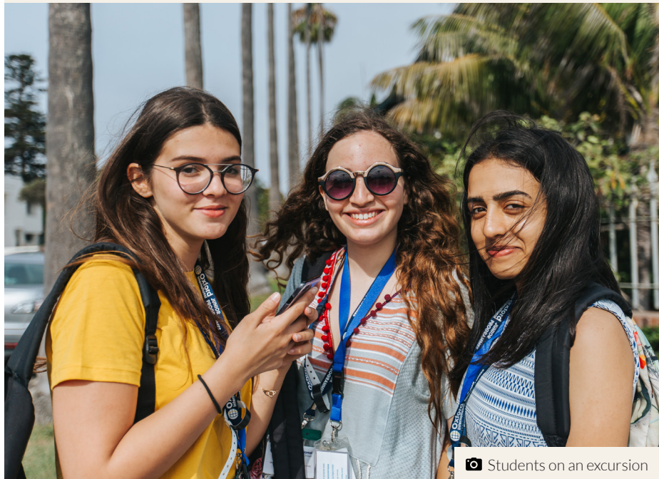
Students on an excursion