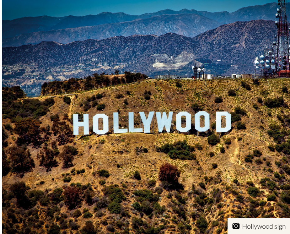
📷 Hollywood sign

Note: California State University's name is strictly for the purpose of identifying the location at which Oxford International Junior Programmes are delivering the programme. Oxford International Junior Programmes have no affiliation with California State University and is not involved in or responsible for the quality, suitability, delivery or other aspects of Oxford International Junior Programmes in any way.