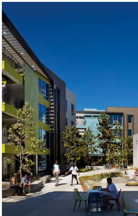
📷 CSUN campus