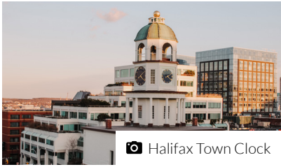
Halifax Town Clock