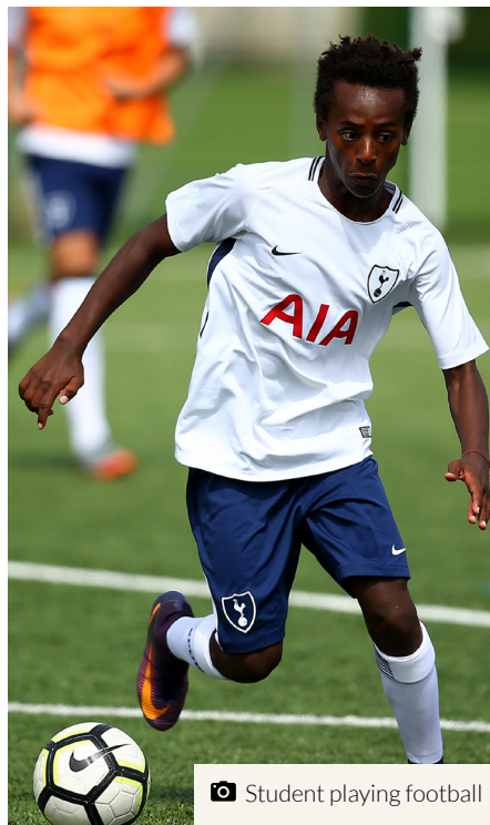
📷 Student playing football