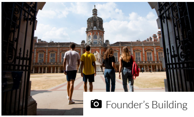
📷 Founder's Building