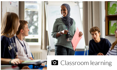
📷 Classroom learning