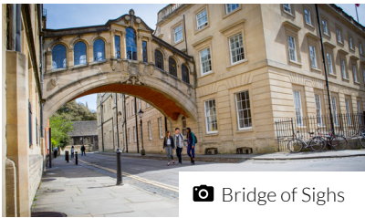
📷 Bridge of Sighs