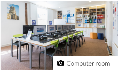
📷 Computer room