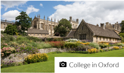
📷 College in Oxford