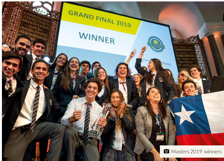
📷 Masters 2019 winners