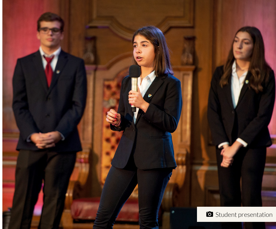
📷 Student presentation