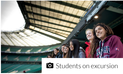
Students on excursion