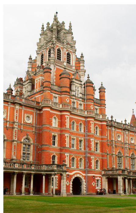
📷 School Campus