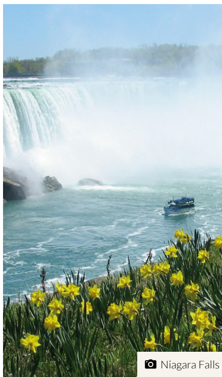
📷 Niagara Falls