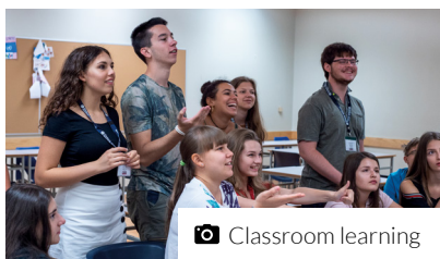
📷 Classroom learning