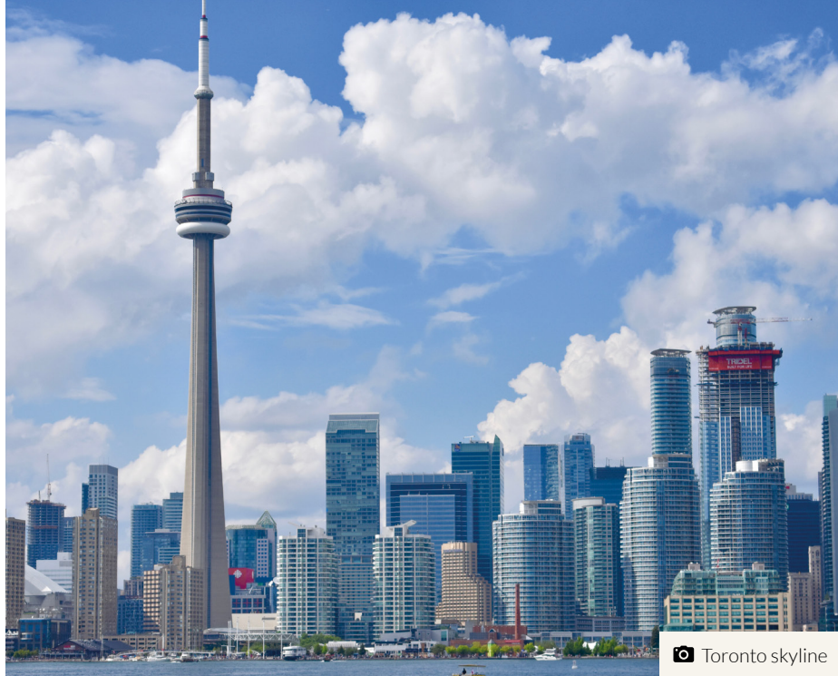
📷 Toronto skyline

Note: The Toronto Metropolitan University name is strictly for the purpose of identifying the location at which Oxford International Junior Programmes are delivering the programme. Oxford International Junior Programmes have no affiliation with Toronto Metropolitan University and is not involved in or responsible for the quality, suitability, delivery or other aspects of Oxford International Junior Programmes in any way.