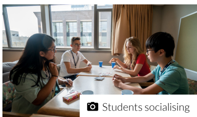
📷 Students socialising