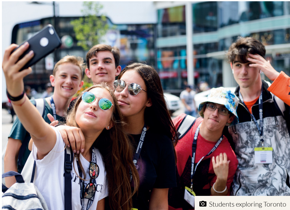
📷 Students exploring Toronto