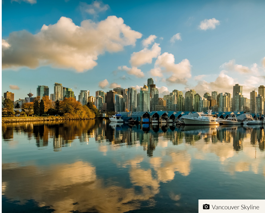
📷 Vancouver Skyline

Note: The University of British Columbia name is strictly for the purpose of identifying the location at which Oxford International Junior Programmes are delivering the programme. Oxford International Junior Programmes have no affiliation with the University of British Columbia and is not involved in or responsible for the quality, suitability, delivery or other aspects of Oxford International Junior Programmes in any way.