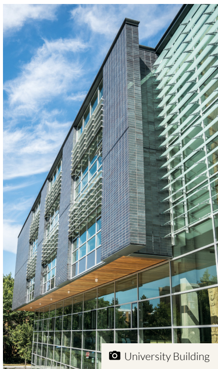
📷 University Building