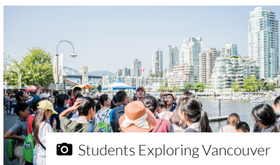
Students Exploring Vancouver