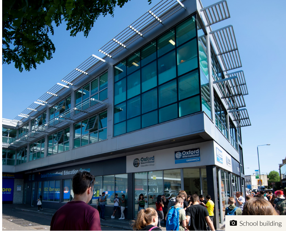
📷 School building