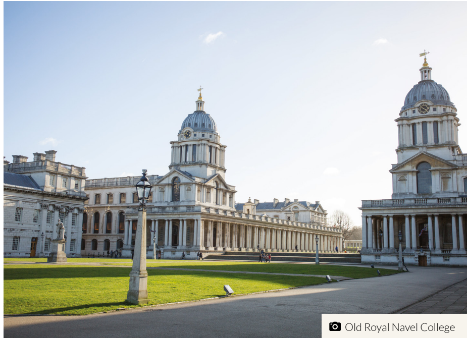
📷 Old Royal Naval College