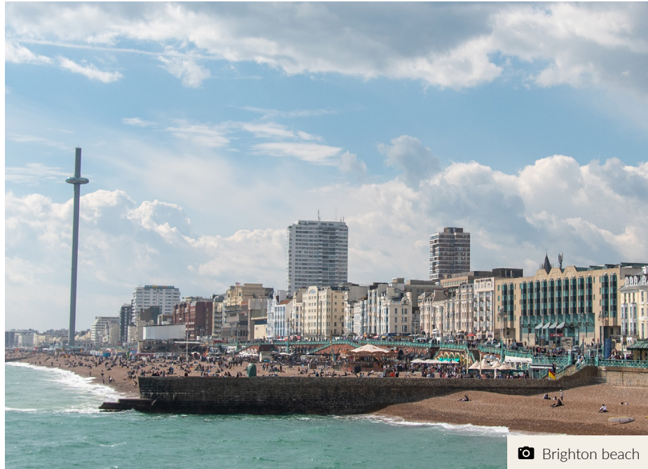
📷 Brighton beach