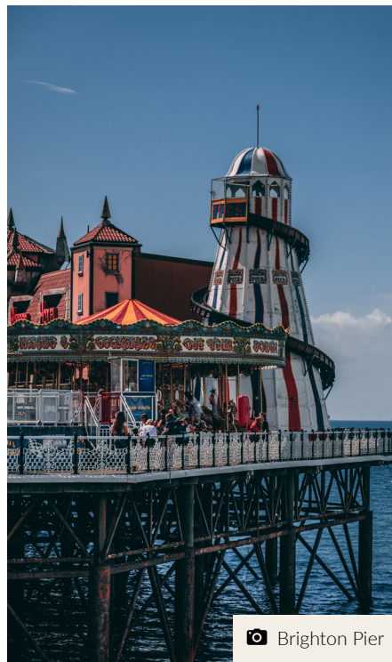
📷 Brighton Pier