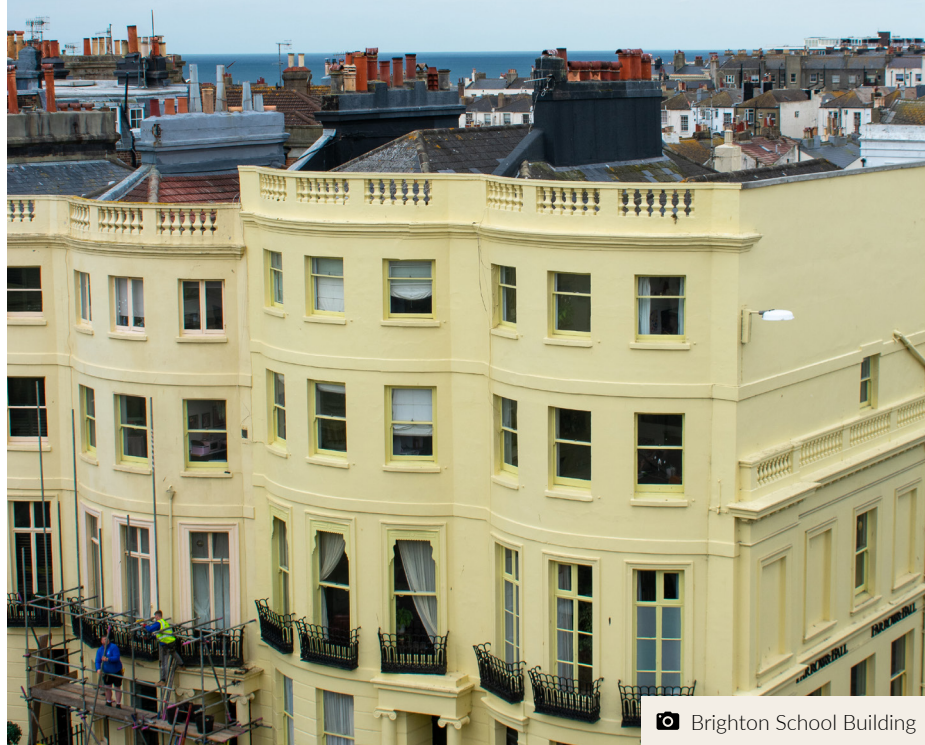
📷 Brighton School Building

*** Subject to demand, availability and weather conditions