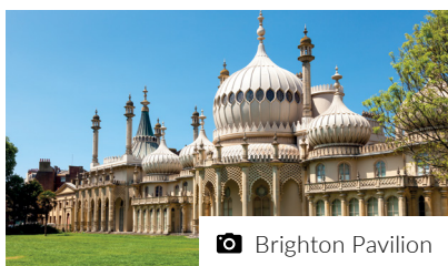
📷 Brighton Pavilion