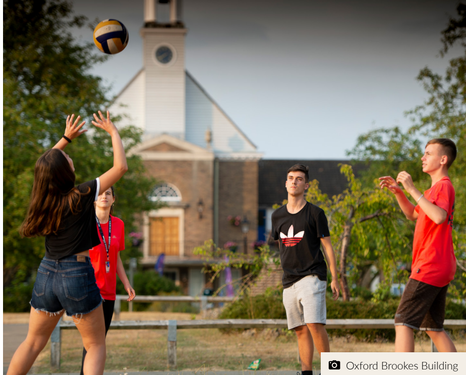
📷 Oxford Brookes Building

1 All students must be born before 1/1/2011