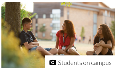
📷 Students on campus