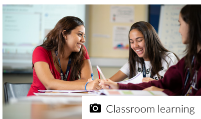
📷 Classroom learning