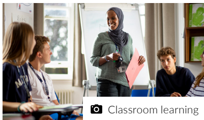
📷 Classroom learning