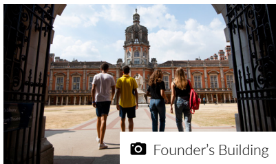
📷 Founder's Building