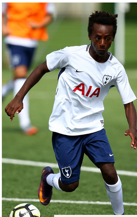
📷 Student playing football