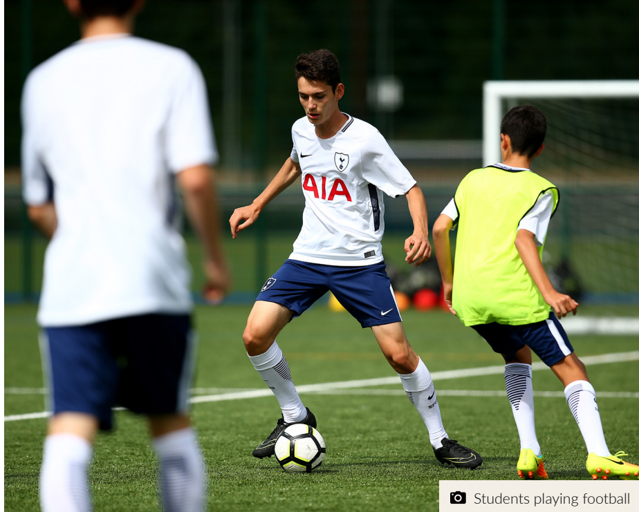
📷 Students playing football