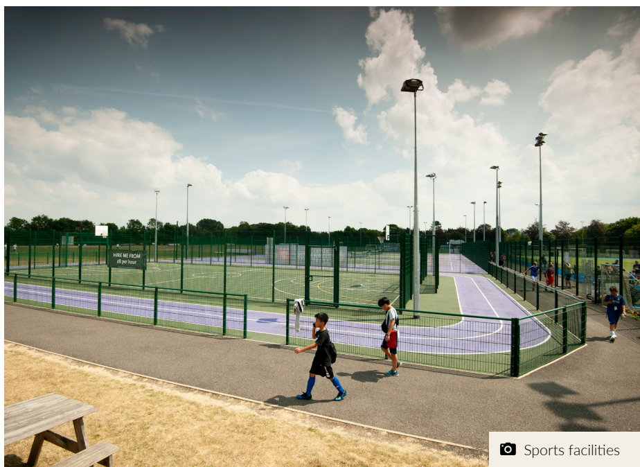
📷 Sports facilities