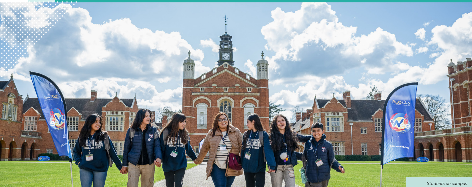
Students on campus