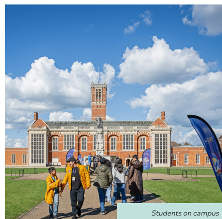
Students on campus