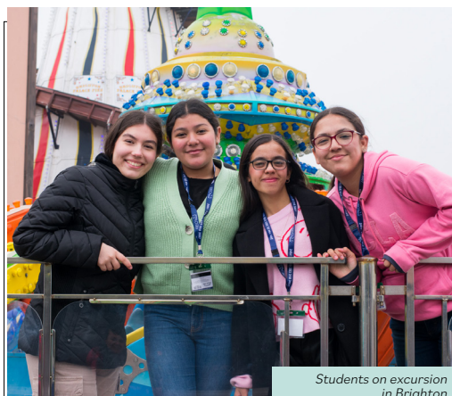
Students on excursion in Brighton

A mixture of single and multi-bedded rooms are available depending on the centre.