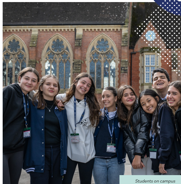
Students on campus