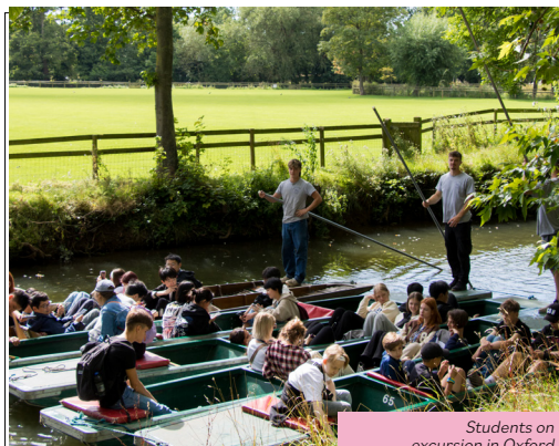
Students on excursion in Oxford