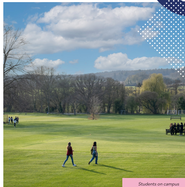
Students on campus