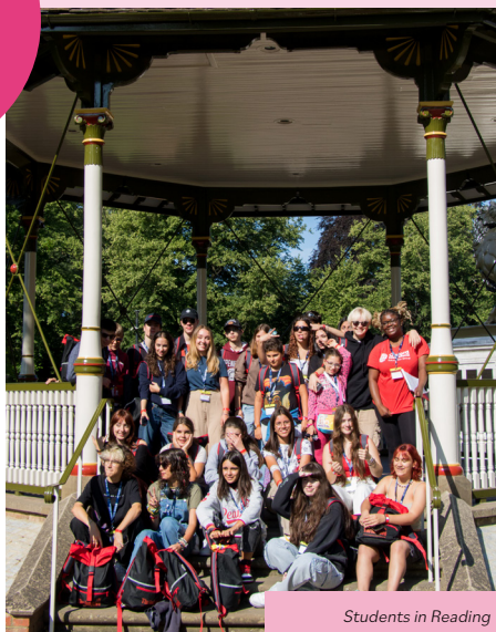
Students in Reading

Experience the wonderful beauty of Bradfield College in the lovely summer season. Situated in the pretty Berkshire countryside, this charming campus provides a taste of a traditional British boarding school. The vibrant green landscape and flourishing gardens make a peaceful setting that encourages you to enjoy the English nature. Enhance your learning through interesting academic courses taught by respected teachers in modern facilities. Improve your English outside of class in special activities and trips to Reading, London, Oxford, and other places.