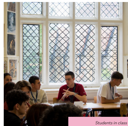
Students in class