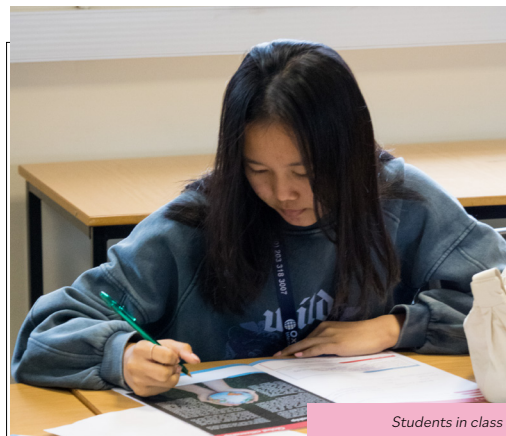
Students in class

Bus Pass: Weekly Brighton city bus pass included with unlimited travel on the Brighton city bus network.