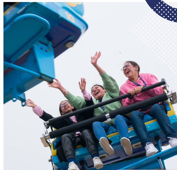
Students on Brighton Pier

Oxford International Brighton, 10 Brunswick Pl, Hove BN3 1NA