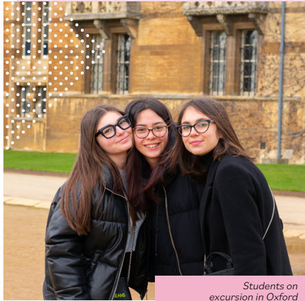
Students on excursion in Oxford