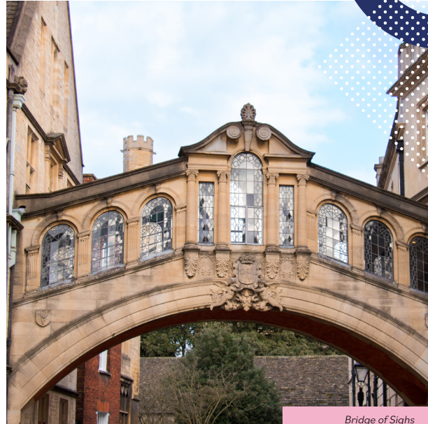
Bridge of Sighs

** (Supplements and minimum numbers may apply)