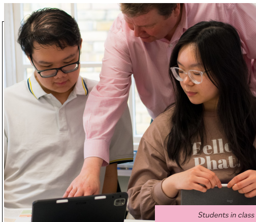
Students in class

Homestay: Twin or triple half-board homestay sharing options. Homestays are approximately 40 minutes to school by bus. Stay with a family for an authentic living in the UK experience.