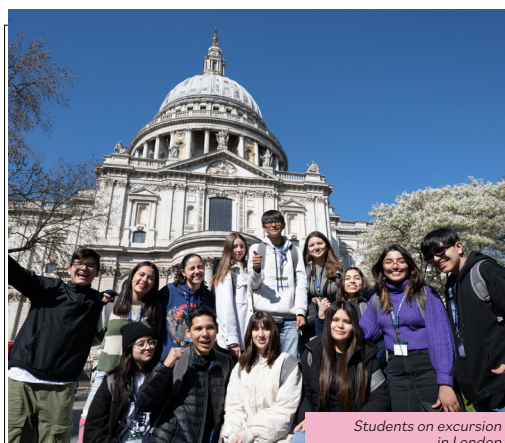
Students on excursion in London

Other: A stunning picture gallery and historic chapel are housed within the world-famous Founder's Building. Social spaces are available within the Students Union such as Tommy's Bar.