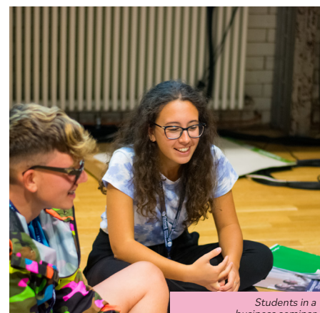
Students in a business seminar