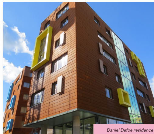
Daniel Defoe residence

Transport: local transportation passes will be provided for scheduled excursions into London.