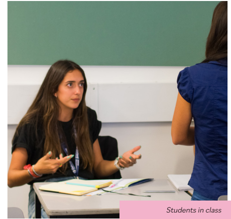
Students in class