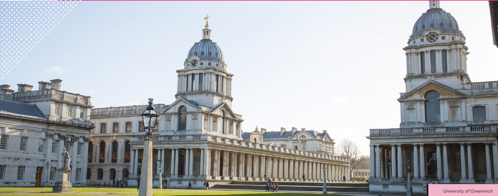
University of Greenwich