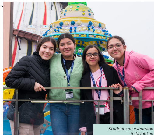
Students on excursion in Brighton

A mixture of single and multi-bedded rooms are available depending on the centre.