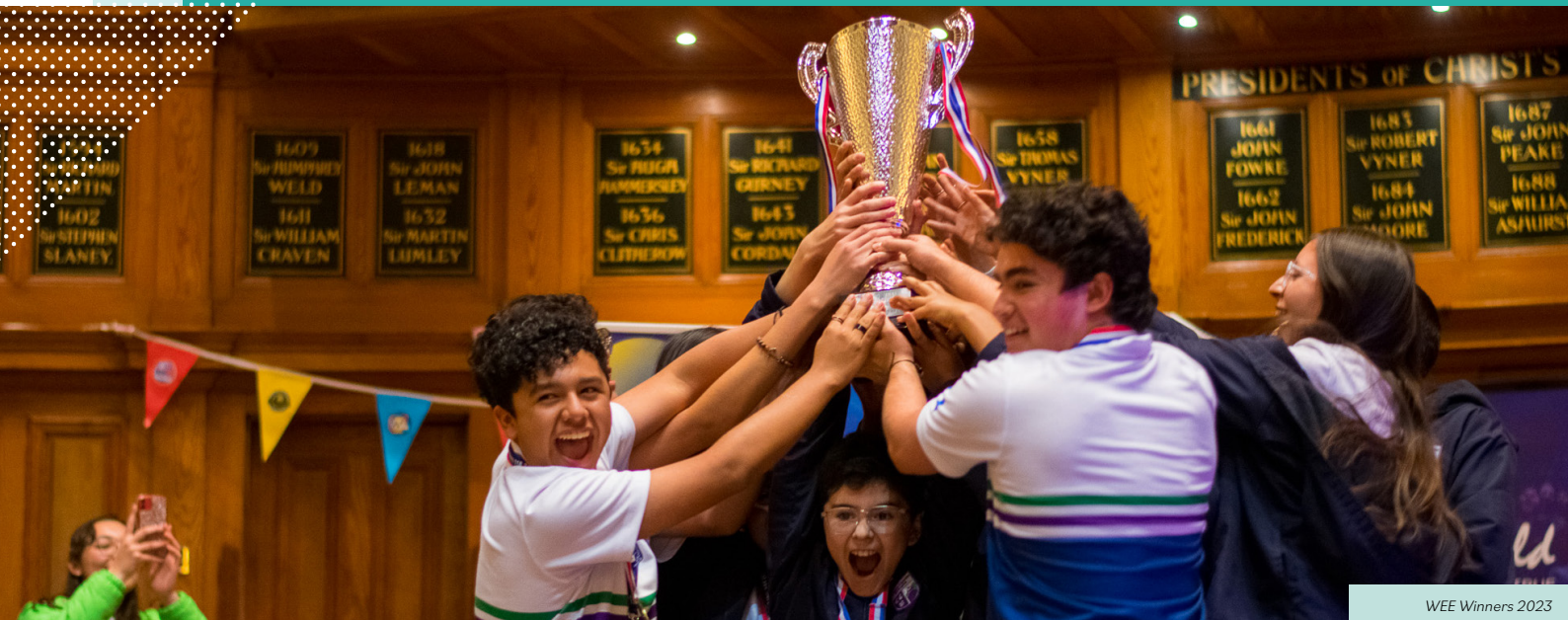
WEE Winners 2023