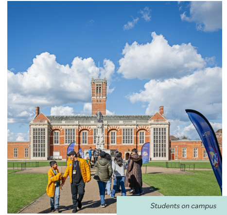
Students on campus