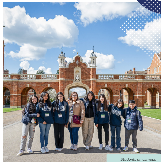
Students on campus