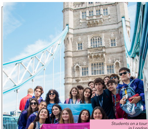
Students on a tour in London

Reception is staffed 24-hours a day. Access is by swipe fobs only. There is also campus wide CCTV. Damage deposits of £25 or €30 will be collected.