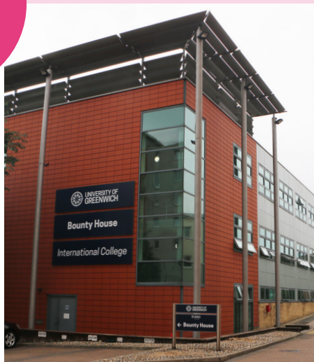
Centre Main Building