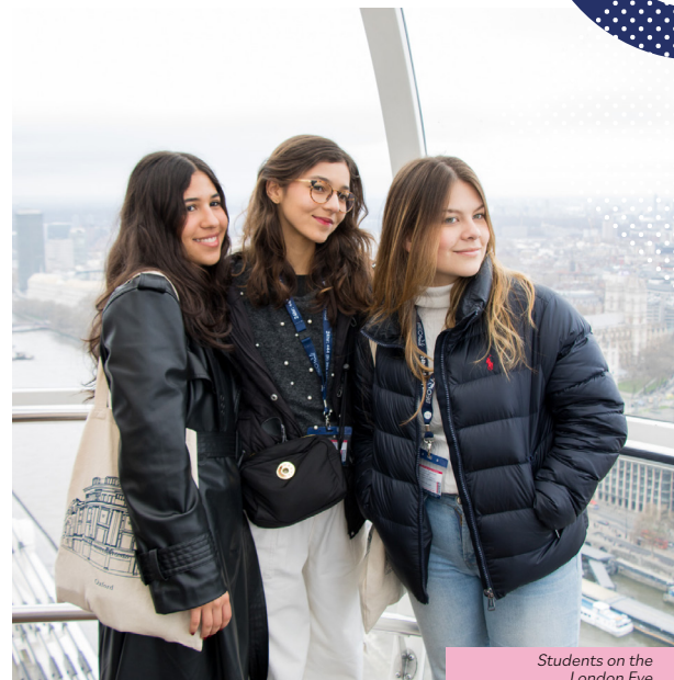
Students on the London Eye

** (Supplements and minimum numbers may apply)