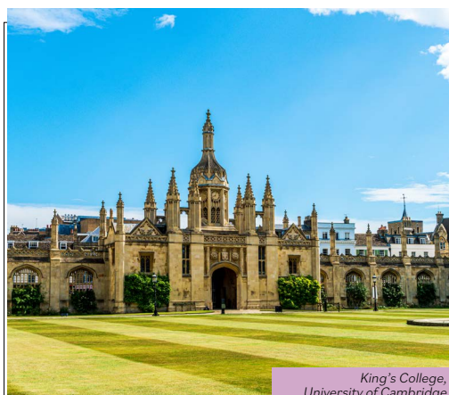
King's College, University of Cambridge

Travelcards: Included on excursions to London.