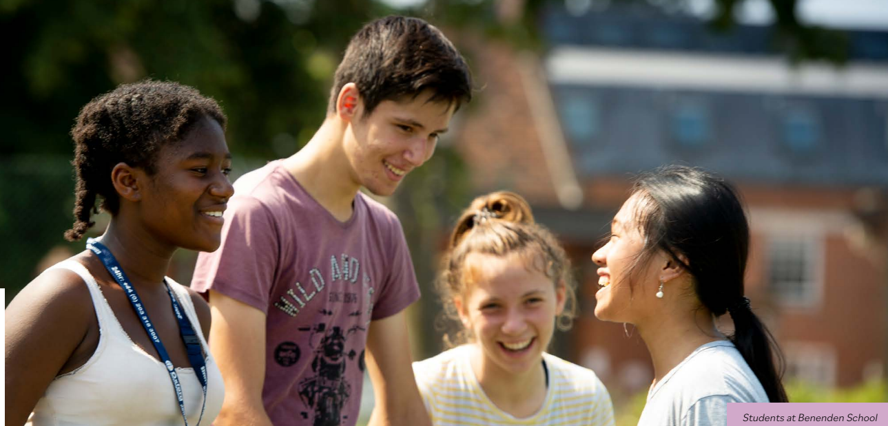
Students at Benenden School