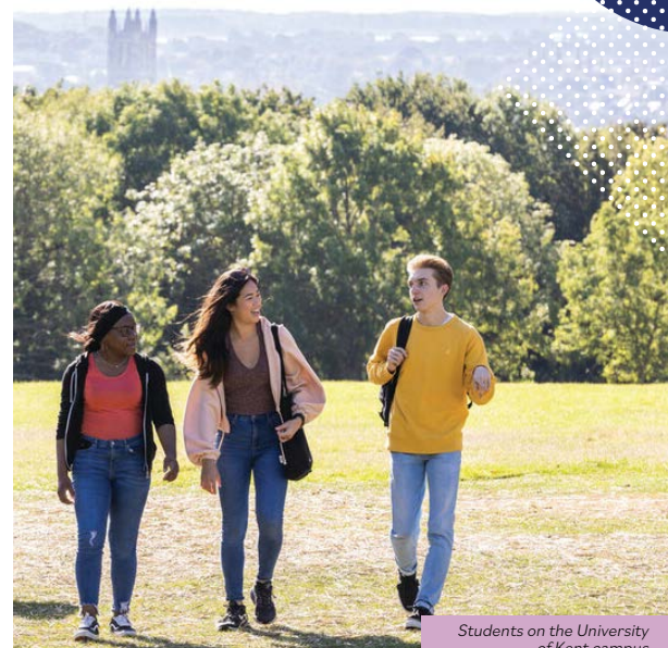
Students on the University of Kent campus