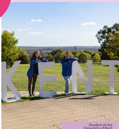
Student at the University of Kent