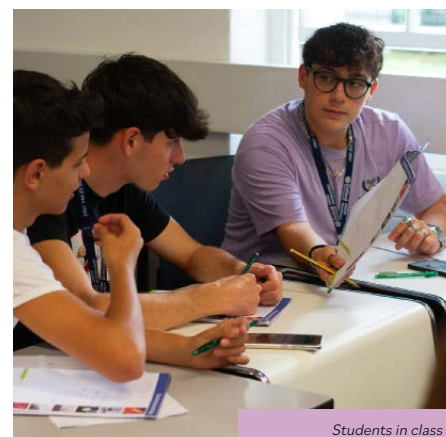
Students in class