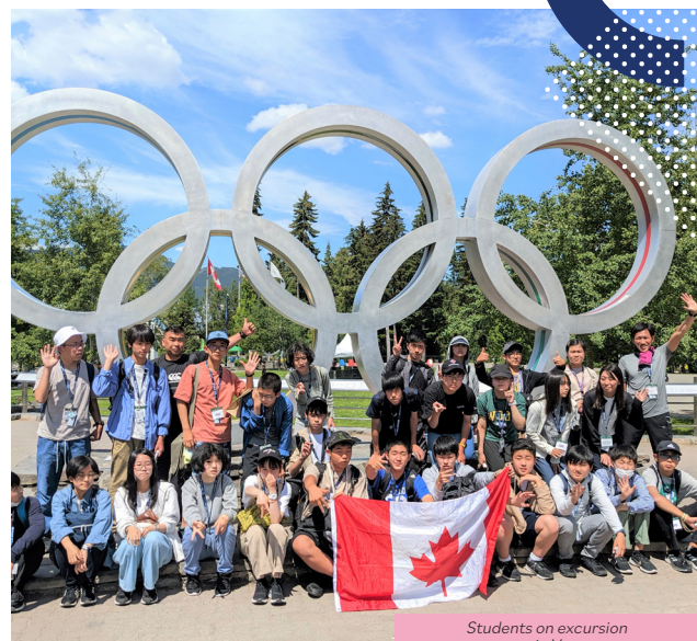
Students on excursion in Vancouver

Our in-house designed Junior program curriculum is British Council approved.