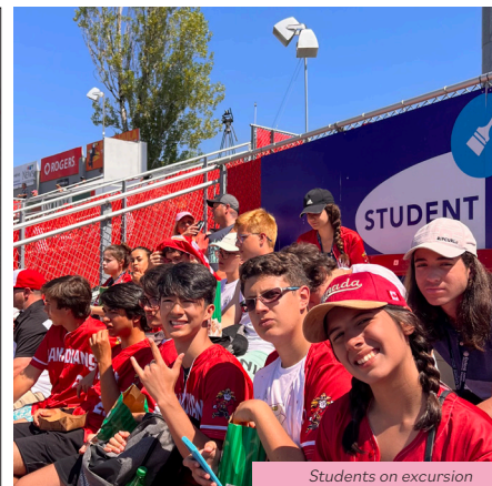
Students on excursion in Vancouver