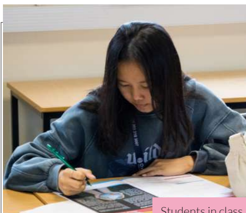
Students in class

Bus Pass: Weekly Brighton city bus pass included with unlimited travel on the Brighton city bus network