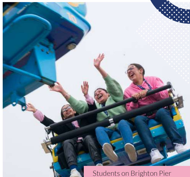
Students on Brighton Pier

Oxford International Brighton, 52 Norfolk Square, BN1 2PA