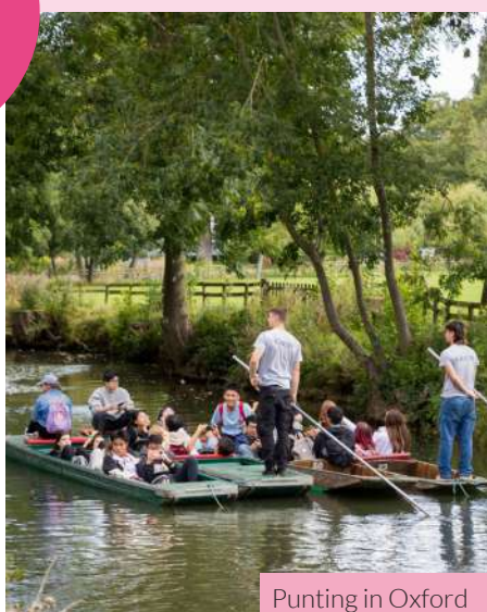
Punting in Oxford

Upon entering Oxford Brookes University, you will promptly feel the calmness enveloping this exceptional learning space. Beyond your studies, you have the chance to uncover the allure of Oxford, conveniently close by, boasting its age-old monuments, vibrant cultural activities, and celebrated academic legacy. The Harcourt Hill Campus seamlessly combines scholarly endeavours with the beauty of nature, ensuring a summer filled with intellectual enrichment and visual delight.