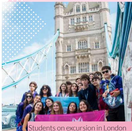
Students on excursion in London