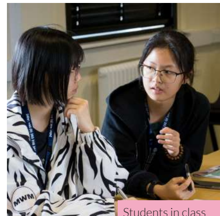
Students in class