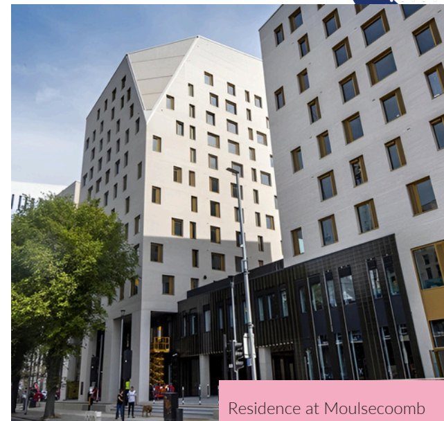
Residence at Moulsecomb

**Supplements and minimum numbers may apply