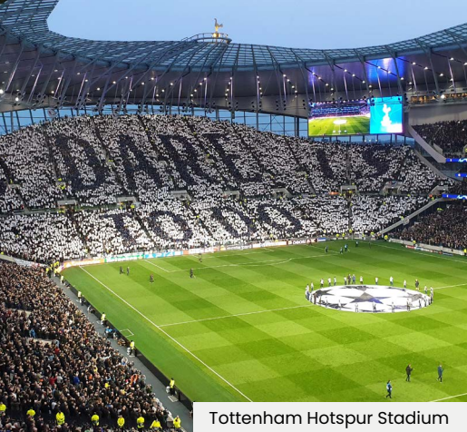
Tottenham Hotspur Stadium