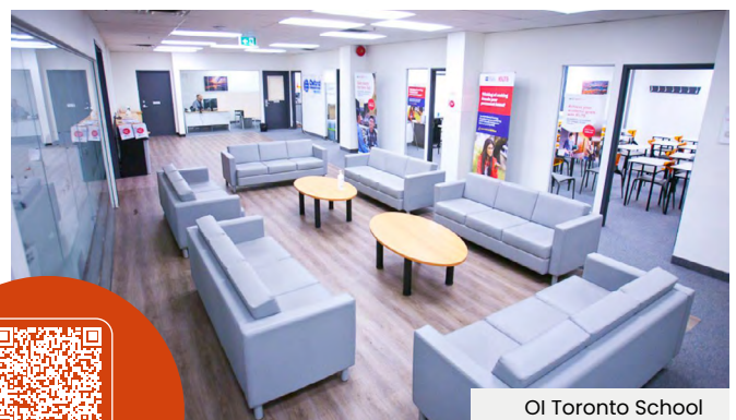
OI Toronto School