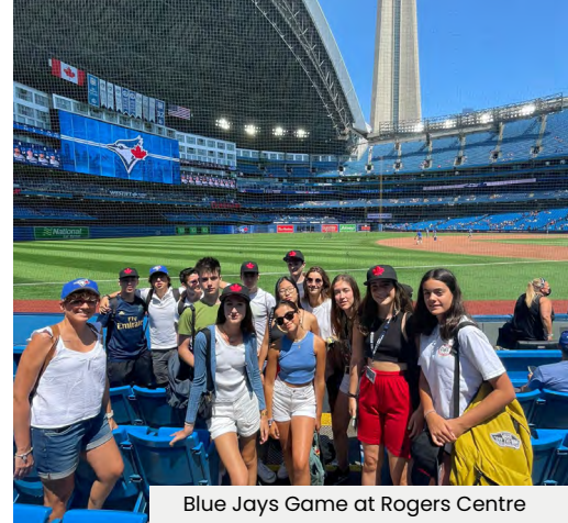
Blue Jays Game at Rogers Centre