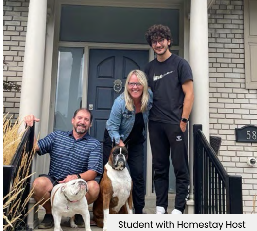
Student with Homestay Host