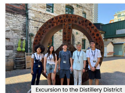
Excursion to the Distillery District