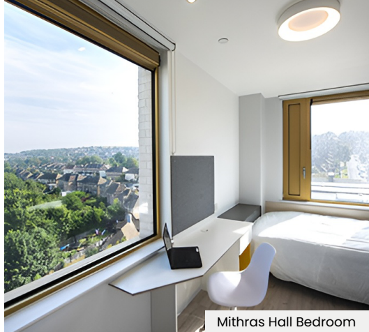
Mithras Hall Bedroom