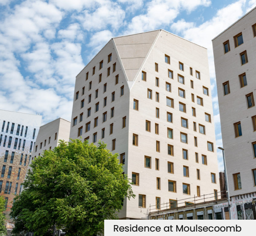
Residence at Moulsecoomb