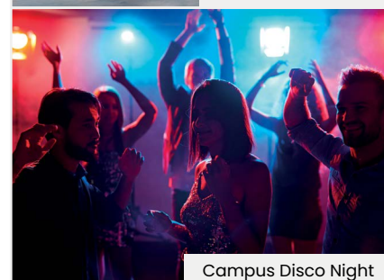
Campus Disco Night

*Activities are a sample only and can change depending on the length of the programme.