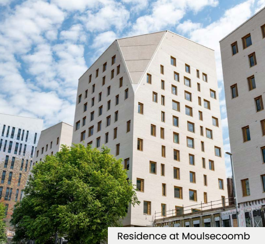
Residence at Moulsecoomb