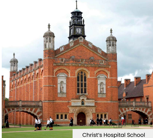
Christ's Hospital School