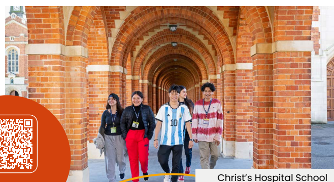
Christ's Hospital School