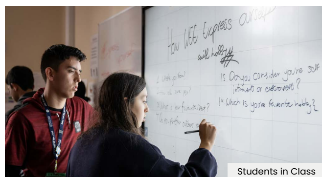
Students in Class

*Academic Skills for Higher Education: minimum English level B1. Minimum 12 students.